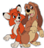
Fox and the Hounds