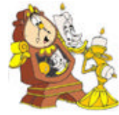
Beauty and the Beast