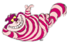
Alice in Wonderland