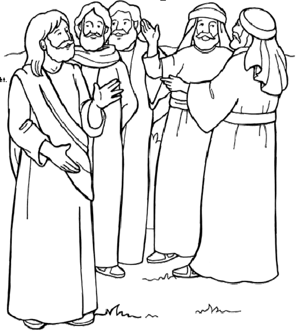
Jesus' First Followers John 1